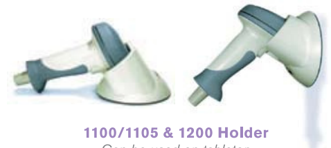
1100/1105 & 1200 Holder Can be used on tabletop or wall mounted