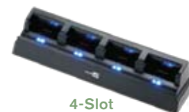
4-Slot Battery Charger