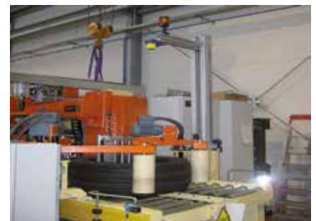
Tires Tracking & Tracing