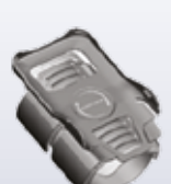
• Wearable Holder