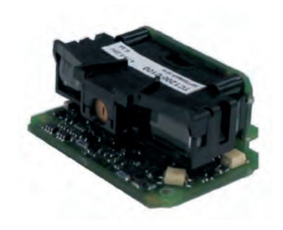
TC1200 SCAN ENGINE MODEL