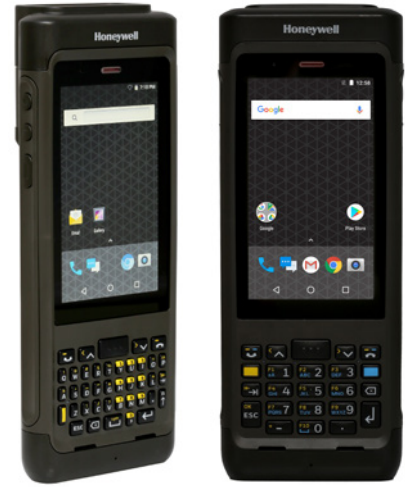
The CN80G ultra-rugged mobile computer provides iron-clad security for U.S. government agencies and contractors, with certifications for FIPS, STIG, and DOD8500.

Built on the Mobility Edge™ platform, the CN80G device offers an integrated hardware and software platform that enables customers to accelerate provisioning, certification, and deployment across the organization. The only platform that offers guaranteed compatibility through Android™ R, Mobility Edge devices promise a product lifecycle extending across four generations of Android to maximize return on investment and provide a lower overall TCO.