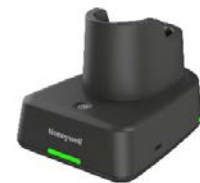
CCB-U00-G-KIT Contactless: CCB-U00-G-WCKIT