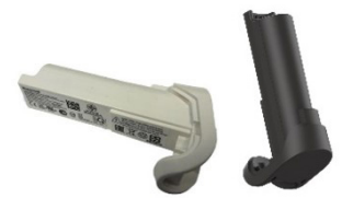
Black: SUPCAP-SCN11WC White: SUPCAP-SCN11WCHC

Battery-free super capacitor for Xenon Ultra 1962 battery-free Bluetooth scanners.