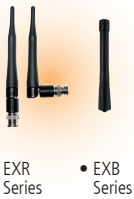
• EXR Series • EXB Series