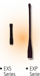
• EXS Series • EXP Series