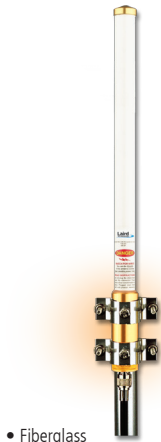
• Fiberglass Omnidirectional