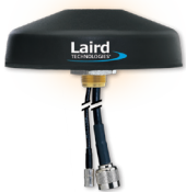
• Dual-band & Tri-band GPS AVL