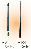
• A Series • EXL Series