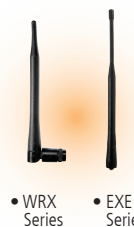
• WRX Series • EXE Series