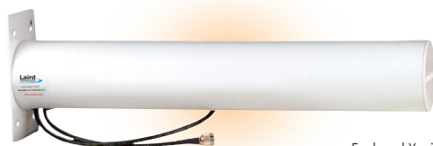
• Enclosed Yagi