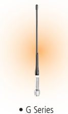
• G Series