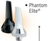
• Phantom Elite®