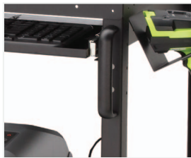
Integrated push handles for easy maneuverability