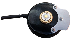
PCTMAG-HD (sold separately)