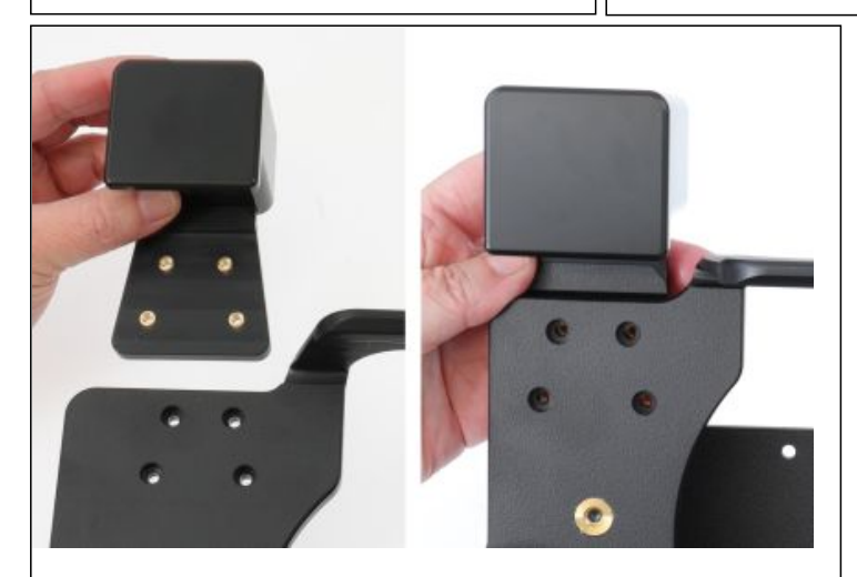
1. Align the Brass Inserts:

Attention: Carefully read all instructions and review the images before installing this product.