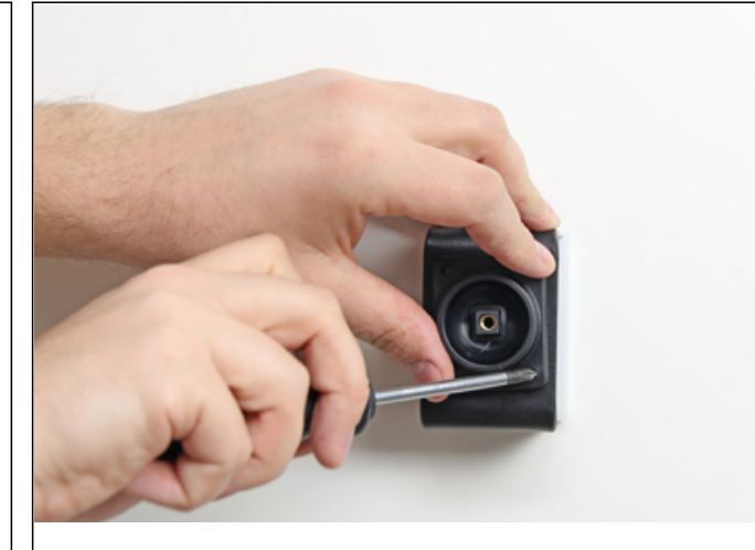
2. Place the Tilt Swivel base plate over the matching holes in your mounting bracket (demo ProClip mount shown in picture). Attach the base plate by using the applicable screws enclosed - self-tapping screws if the mount has small holes or machine screws with nuts if the mount has larger holes.

1. Unscrew the screw in the center of the holder and remove the holder from the Tilt Swivel base plate.