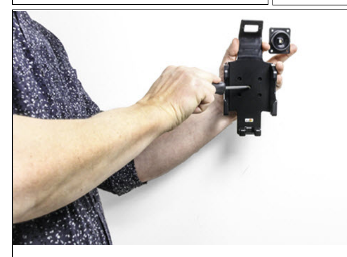
1. Unscrew the screw in the center of the holder and remove the holder from the Tilt Swivel base plate.

Carefully read all instructions and review the images before installing this product.