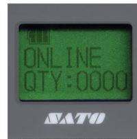
Large LCD Display (802.11 b/g model)