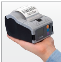
Small & Light Durable & Dependable

Quick and Durable. Ultimate Performance and Mobility.