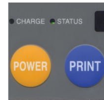
Large Operator Control Buttons