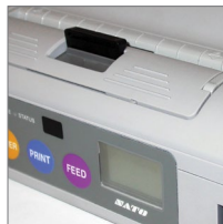
Top Cover Opening for Easy Media Load