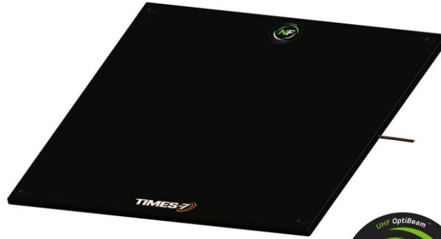
The A1030 Near Field Antenna