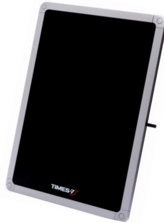
The SlimLine A6032